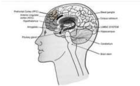
Fig. 2. The Triune Brain

developed societies bigger than those of our immediate ancestors—the chimpanzees. As we started using the neocortex to explore and embody meaning and purpose, we became more and more free of animality. We developed bigger and bigger social identity; we developed civilizations. This drive for meaning and purpose was the trigger in the course of evolution that allowed the human genus homo to move from the earlier human form to the more advanced Homo Sapiens when their material bodies were ready.