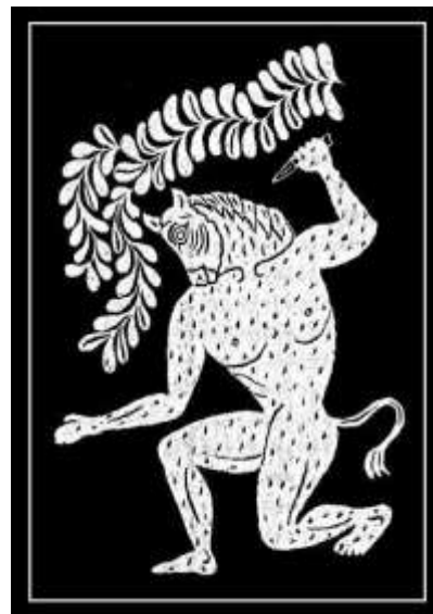
Fig. 1. Part human part animal. (Artist's rendition of Picasso's The Minotaur )