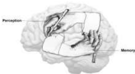
Fig. 4. Tangled hierarchy in the brain. Perception creates memory, memory creates perception in the style of M. C. Escher's Drawing Hands .

Now you can appreciate a depiction of tangled hierarchy in a style originally created by the artist M.C. Escher, Drawing Hands (fig. 4). In the original Escher picture, the left hand seems to draw the right, and vice versa. And it is an appearance; behind the scenes, Escher is drawing both from the inviolate level. For the brain, perception and memory apparatuses are each creating the other.