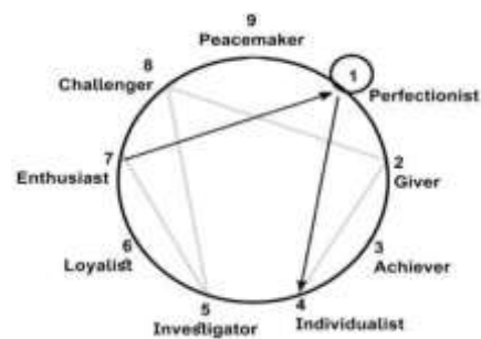
Fig. 6. The 9 personalities of the enneagram. Personalities 2-4 define the heart type, 5-7 the head type, and 8-1 the body type.

People who take these quantum leaps develop healthy personalities that are classified as body-type, head-type, and heart-type and can be explored and identified in what is called an enneagram (fig. 6). Each type is further divided into three enneagram categories. The enneagram personality categories are given self-explanatory names not requiring further elaboration.