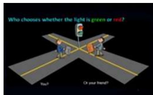
Fig. 3. The paradox of Wigner's friend: who gets to choose?

When this nonlocal consciousness sees through the tangled hierarchical brain and identifies with the brain being caught in the tangled hierarchy, it produces a representation of unity consciousness, a unity self that we call quantum self. The simple hierarchy of the ego is created via conditioning via reflection in the mirror of memory. Read the book, The Quantum Brain 15 , for further details.